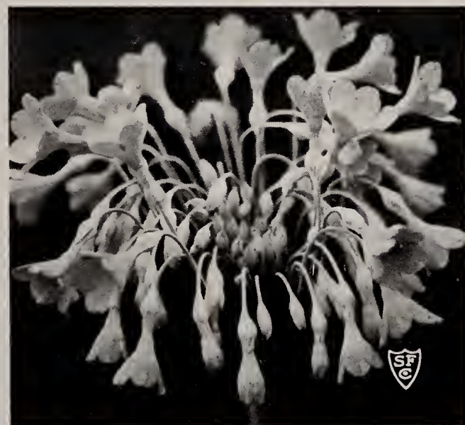
PRIMULAS. Many fine sorts for garden use, such as Auriculas, Wanda, Juliae veris, Florindae, Cashmeriana, etc. Priced 15c to 50c each.